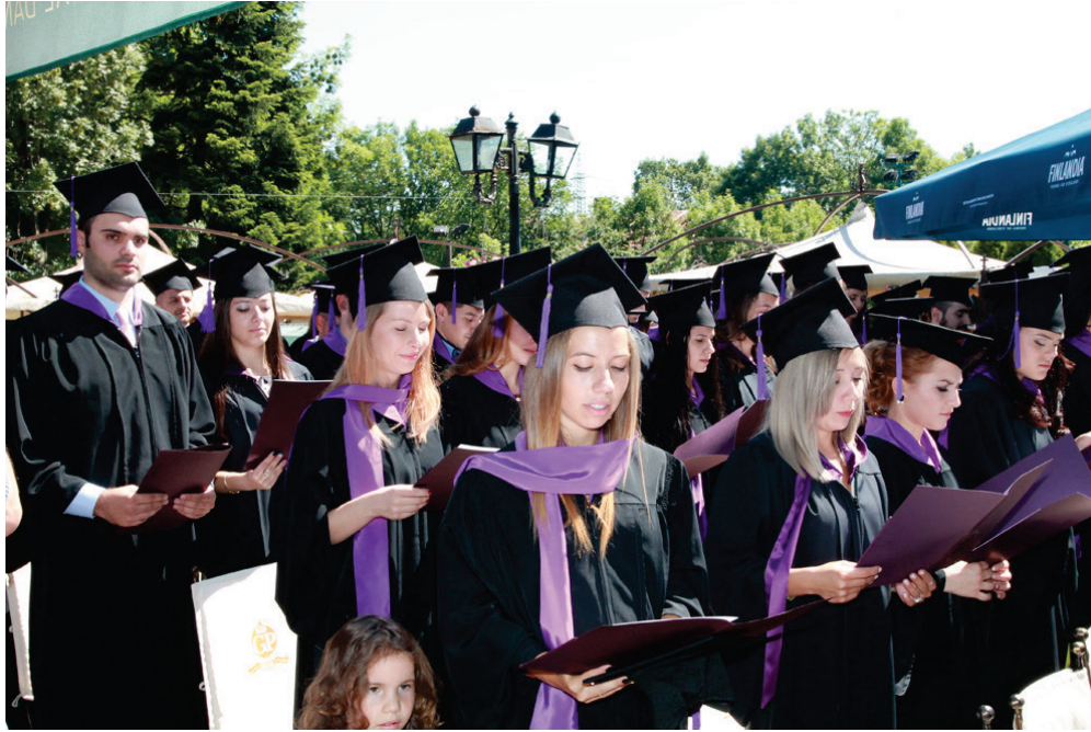
Graduation Ceremony - 2017